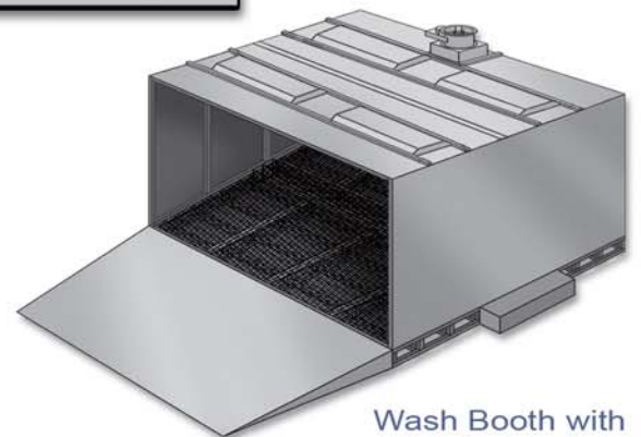
Wash Booth with Ramp and Exhaust